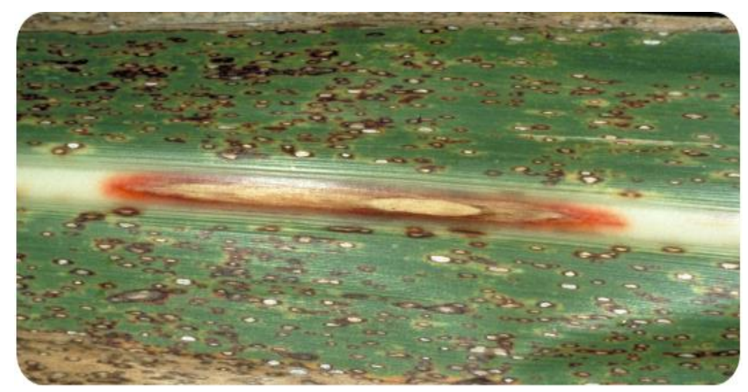
Figure 3. Symptoms of red rot in the midrib of sugarcane leaf.