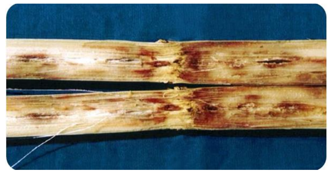
Figure 2. Internal symptoms of red rot in a sugarcane stalk.

margins of the 3<sup>rd</sup> and 4<sup>th</sup> leaf from the crown may dry up. To diagnose red rot in sugarcane, one can accomplish this by splitting the standing cane stalk, uncovering longitudinal reddening within the typically white or yellowish-white inner tissues. These reddish streaks are occasionally interrupted by white patches along the stalk. Moreover, externally, brown or reddish-brown stripes become visible at the nodal regions, and a distinct sour, alcoholic odor emanates from the affected tissue. As the disease advances, minuscule acervuli emerge on the outer surface of the upper internodes, followed by the development of a cottony gray fungal mass in the pith region, which yields a profusion of spores. Rotting occurs during the August-September growth phase. Initially, the disease is undetectable in the field, but as internal tissues suffer extensive damage and decay, some discoloration of the rind becomes visible. The consequences can range from the death of a few plants or clumps to the complete failure of the crop. Lighter-colored sugarcane genotypes may have more noticeable discoloration (Saksena et al., 2013).