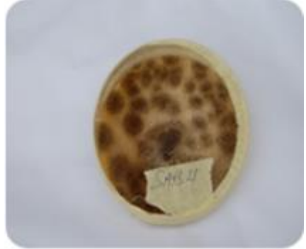
Plate 4A. Photograph of Aspergillus niger X 0.5