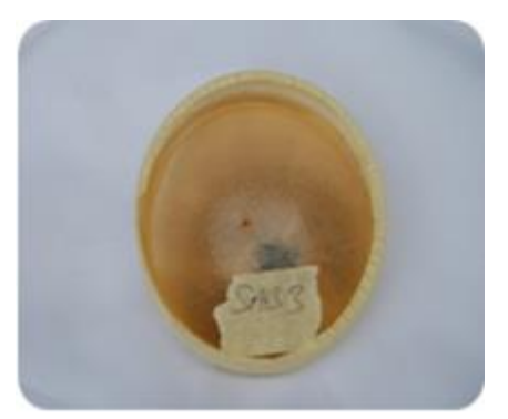
Plate 3A. Photograph of Aspergillus tubingensis X 0.5