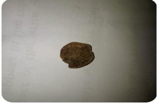
Plate 5b. Diseased Seed of I. gabonensis X 0.8

a value that falls within the range 10.23 recorded for Bombax glabrum (Adeleke and Abiodun, 2010), but lower than recorded for M.oliefera seeds, 29.36% (Anwar and Rashid, 2007), and Glycine max , 40.13% (Maidala et al. , 2013). Furthermore, I. gabonensis can be said to be a rich source of carbohydrate as the carbohydrate level in both the healthy (24.8000) and diseased (22.9367) seeds of I. gabonensis were higher than what was obtained for other oilseeds such as B. glabrum , 16.60% (Adeleke and Abiodun, 2010) and Arachis hypogeae , 1.81% (Atasie et al. , 2009). Fat is important in diets as it promotes the absorption of fat soluble vitamins. Also, fat is a high energy nutrient and does not add to the bulk of the diet (Atasie et al. , 2009).