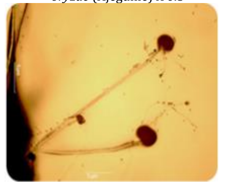
Plate 3B. Phtotmicrograph of A. tubingensis X 100