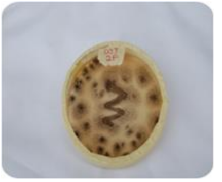
Plate 1A. Photograph of Aspergillus oryzae (Ajegunle) X 0.5