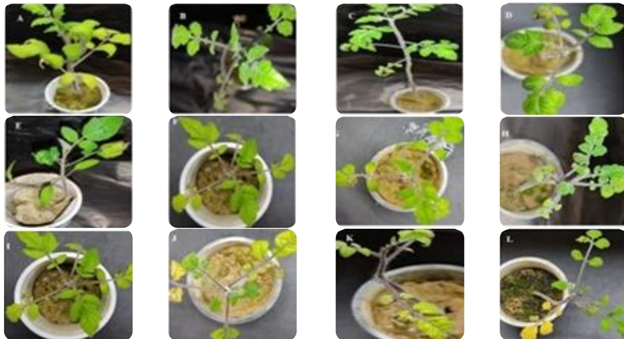
Figure 1. (A-C) Positive control plants; (D-F) Plants agroinfiltrated with ToLCNDV infectious clone; (G-I) Plants treated with heat at 40°C, 45°C, and 50°C for a duration of two hours; (J-L) Agroinfiltrated plants with ToLCNDV and treated with heat at 40°C, 45°C, and 50°C for a duration of two hours.

0.5 in fresh medium were resuspended in an infiltration buffer (Zheng et al. , 2021). The lower epidermis of 4-5 weeks old tomato plant leaves was subjected to infiltration using a needleless 1 ml syringe containing the ToLCNDV clone of both genome A (Accession # OQ190948) and genome B (Accession # LN854628) as shown in figure-1. The control plant underwent infiltration with a mock Agrobacterium suspension. The experimental procedure was executed in triplicate.