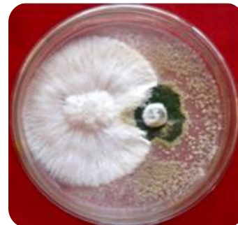
Figure 3. Mechanisms of inhibition by antibiosis by indigenous Trichoderma isolates against S. Rolfsii . a: ST4 (ASL) and b: ST8 (LKP).

Similarly, Berlian et al. (2013) stated that antibiosis was an antagonistic mechanism involving metabolites that caused lysis, enzymes, volatile and non-volatile compounds, or toxins produced by a microorganism. Secondary metabolites produced by Trichoderma spp. also played an important role in its anti-fungal activities. The effectiveness of the mechanism of antibiosis was evidenced by the suppression of the growth of pathogenic fungi on solid media. Trichoderma spp. penetrate the host cell walls with the help of cell wall degrading enzymes viz. chitinase, glucanase, protease, and then use the contents of the host hyphae as a food source. Hallmann (2001) argued that enzymes that act on the mechanism of antibiosis occur due to direct contact with pathogens so that pathogenic hyphae that surround the colony of antagonistic microorganisms may have lysis or the formation of clear zones which form a barrier between the two. According to Mukarlina