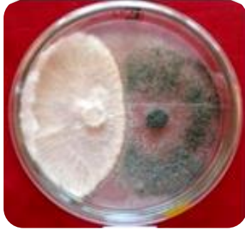
Figure 2. Mechanisms of inhibition by Trichoderma indigenus isolate LKA against S. rolfsii (mechanism of space competition in the treatment ST3).

The other mechanism of action of indigenous Trichoderma isolates in inhibiting pathogens was antibiosis. The mechanism of antibiosis was characterized by the formation of a clear zone between