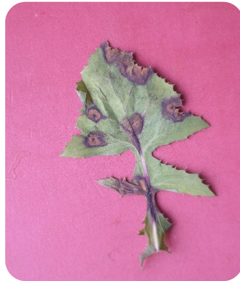
Figure 2. Leaf spots on Sonchus asper due to A. sonchi

plants grown on water channels around the tomato and wheat fields at NIAB, Faisalabad, Pakistan were found with different leaf blight symptoms. Spots initially were small, epiphyllous, irregular, scattered to margins and dark-brown. These spots enlarged rapidly up to 2-15 mm in diameter, became orbicular to irregular but often angular when limited by veins of the leaf, with brown to cinereous necrotic centers and usually with a narrow dark margin (Figure 2).