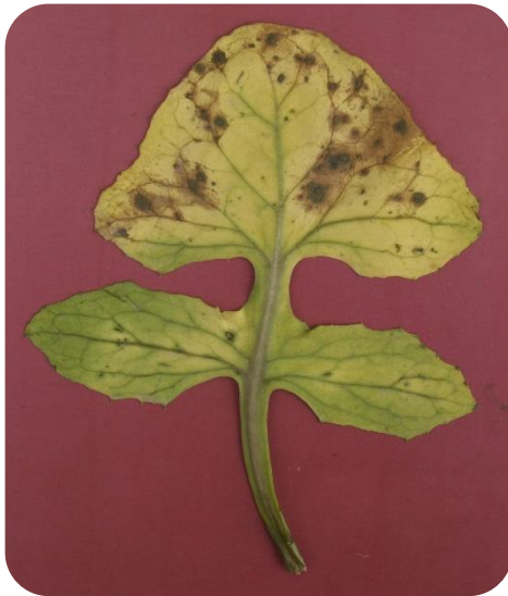
Figure 1. Leaf spots on Sonchus asper due to A. alternata

In February 2013, S. asper plants grown in and around the chickpea and tomato fields at Nuclear Institute for Agriculture and Biology (NIAB), Faisalabad, Pakistan were found to be severely affected by a leaf blight disease. Initially the disease symptoms began as small, circular, dark, necrotic lesions usually on the older leaves. At later stage, these lesions enlarged rapidly up to 4-12 mm in diameter and when spotting was abundant the entire leaf turned yellow (Figure 1). However, in April 2013, S. asper