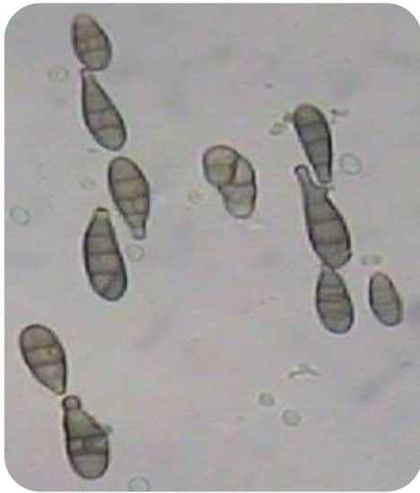
Figure 3. Spores of Alternaria alternata

grown healthy S. asper plants separately for each fungus species using an atomizer until runoff. After inoculation, plants were covered with polyethylene bags for 72 hours to maintain high humidity and then kept in a glasshouse at 25-30°C. Three days after inoculation, numerous spots were developed on the leaves of inoculated plants. After 7-9 days these spots expanded and became similar to those examined under field condition for each test fungus. The fungi A. alternata and A. sonchi with similar cultural and morphological characteristics were re-isolated consistently from these leaves.