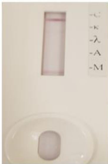
Figure 3. Results from the isotyping assays, illustrating the IgG1 heavy chain specificity of mAbs 3B-5 (5C3).

These results highlight the successful development and characterization of monoclonal antibodies against PPRV. They showed that the antibodies could be used in diagnostic assays. They also support further research into the immune response to PPRV infection.