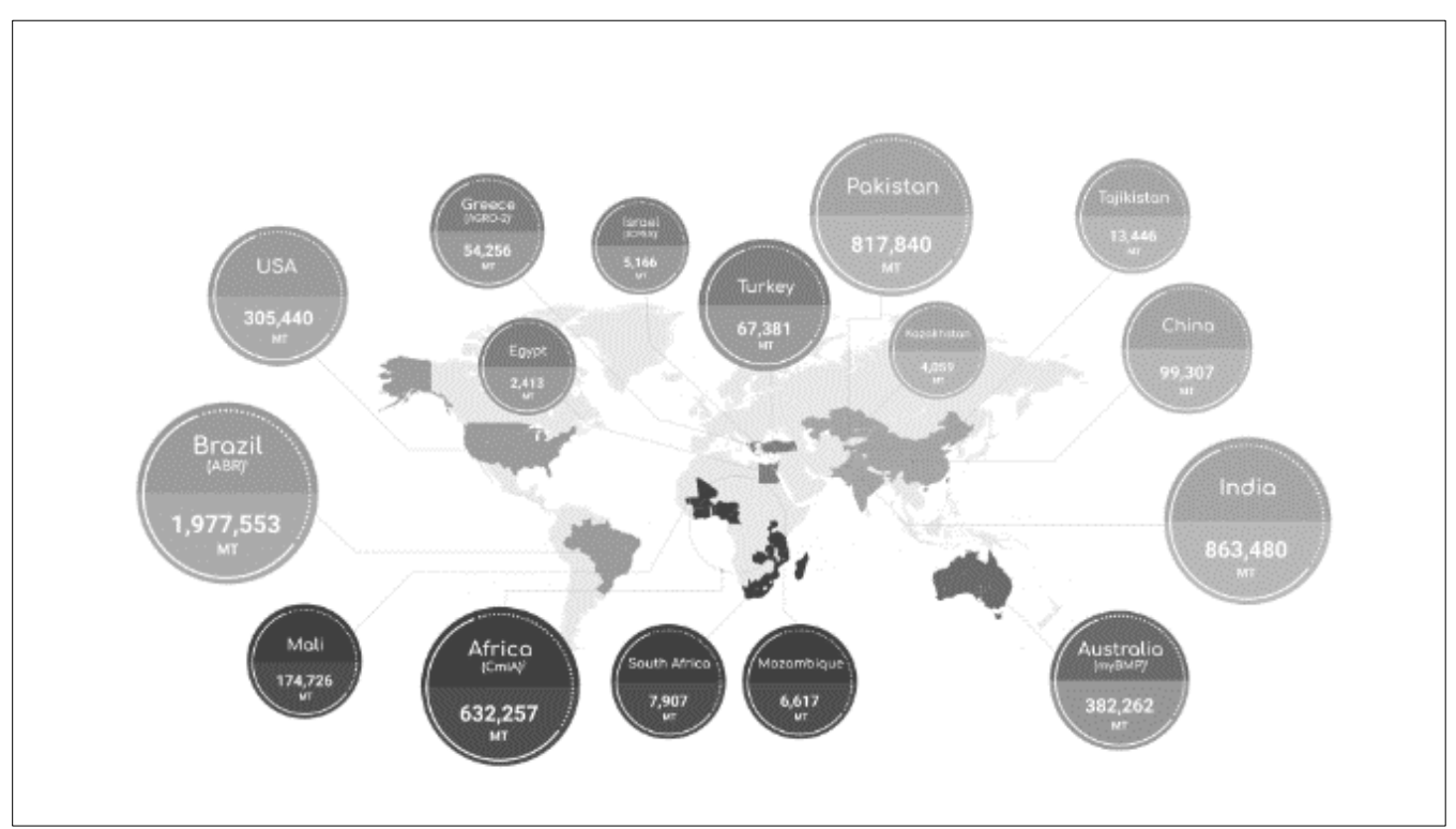
Figure 1 depicts global cotton production (metric tons) as of the year 2022-23 according to the annual report of "Better Cotton Initiative" global organization (Ghori et al. , 2022).

variety of G. arboreum was raised in Pakistan. In the 1930s, Gossypium hirsutum was first grown in tandem with the subcontinent's textile revolution. Less than 2% of Pakistan's cotton-growing acreage is currently planted with G. arboreum as a result of the species' gradual shift in cultivation. Its cultivation is expected to drop even further (Malik & Ahsan, 2016).