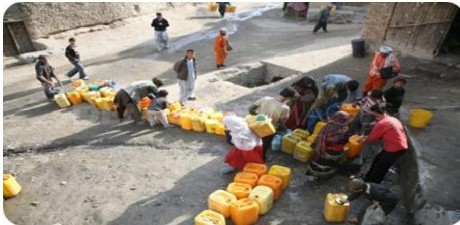
Picture 1. Scarcity fresh water in Afghanistan.

Safe and Fresh Water: Drinking safe and clean water is a basic human right. Lack of potable water affects sanitation, food supplies, health and economic development. Dirty water from industrial centers should be dumped in proper places in a safe way so that it doesn't pollute the ground clean water supplies. Only 13 % of afghan people have access to safe water (www.actionaid.org.uk). Both the civil and long term conflict and severe drought have played significant and comprehensive affects on damaging Karezes and shallow wheels in some provinces of Afghanistan like Kandahar and neighbor provinces because traditional Kareze system (Ground water supply) one of the main potable water resources for Afghan people. During the three recent decade years shallow water wheels and Karezes as a result of drought, conflicts and lack of water management system two-thirds of them were completely dried. Meanwhile lack of safe clean water created water-burn diseases such as dysentery and diarrhea. Lack of good sanitation and low awareness also contributes spread diseases impacts on food production. Irrigate crops also belongs to water scarcity.