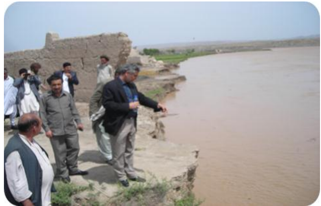
Picture 2. Kaldar district of Balkh province Amu Darya River. (2010).

Flood Impacts: Floods in Afghanistan have increased significantly due to deforestation and vegetation losses, which decrease the water holding capacity of the lands. In Afghanistan some years as a result of flooding 1000 acres of farm lands destroyed. In June-July every year hundred hectares land in the riparian provinces of the northern part of Afghanistan destroyed by Amu Darya river because in the smelting snow and glacier season the Amu Darya river, water level increasing. From Kaldar and Shortepa districts people lose their houses, agricultural lands and animals.