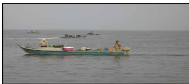
Fishing crafts in the lake