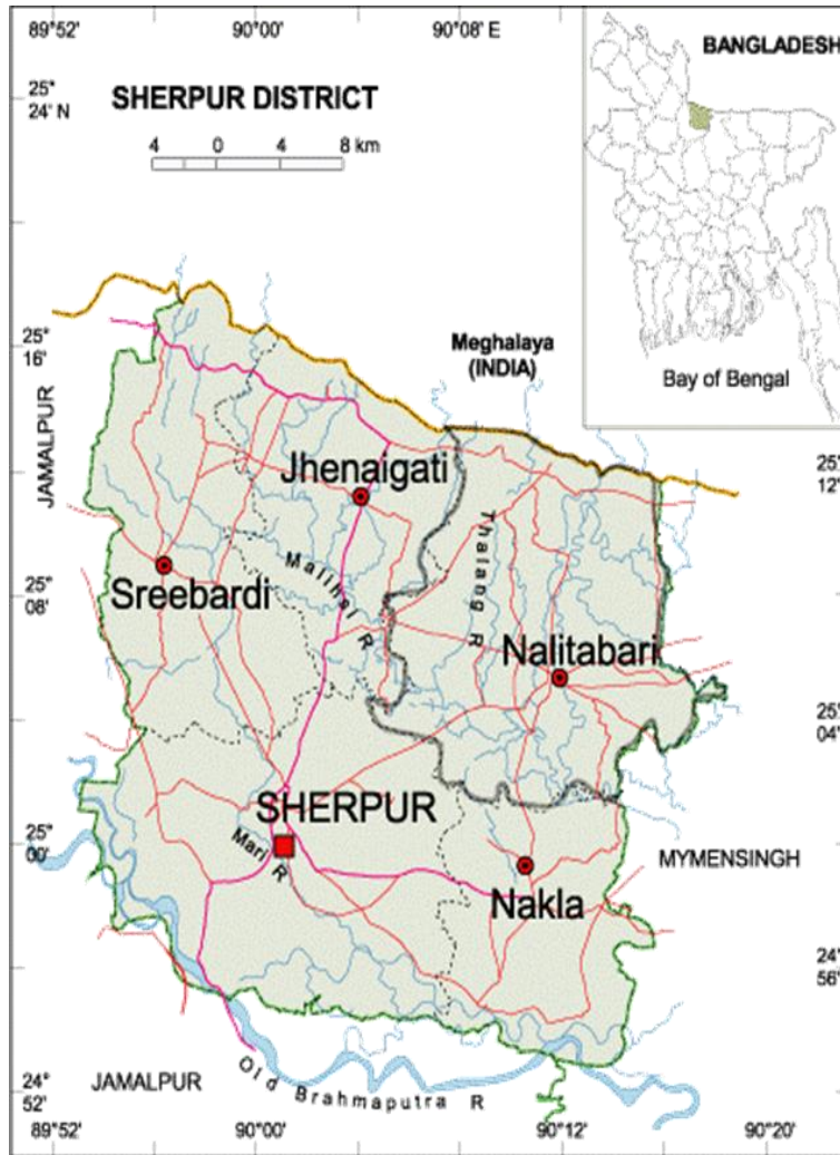
Figure 2. Map of Sherpur district, Bangladesh showing study area.

Note: 'PF' denotes Project farmers and 'Non-PF' denotes Non-Project Farmers.